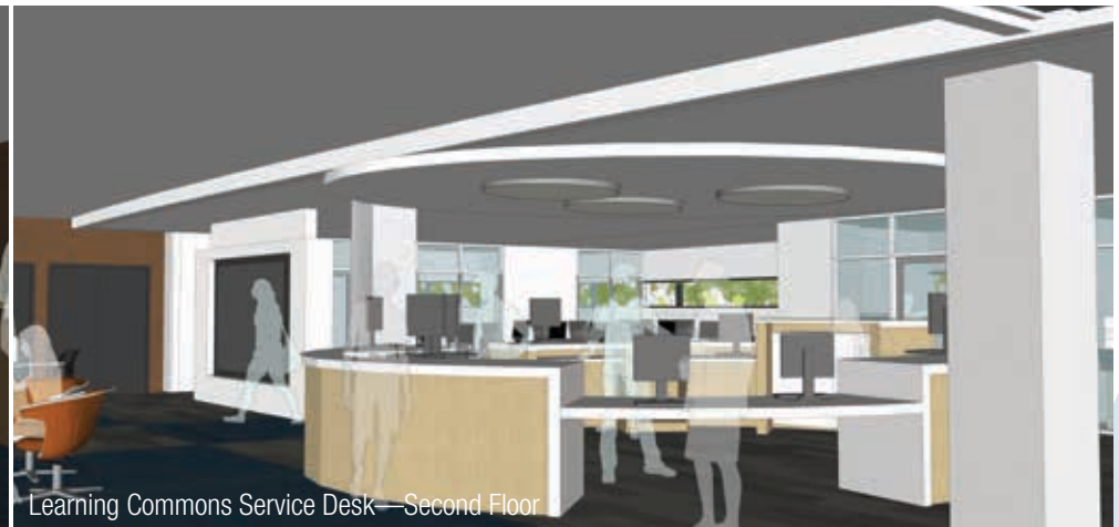
Learning Commons Service Desk—Second Floor