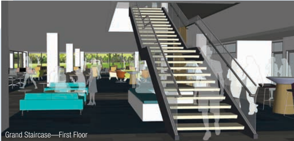
Grand Staircase—First Floor