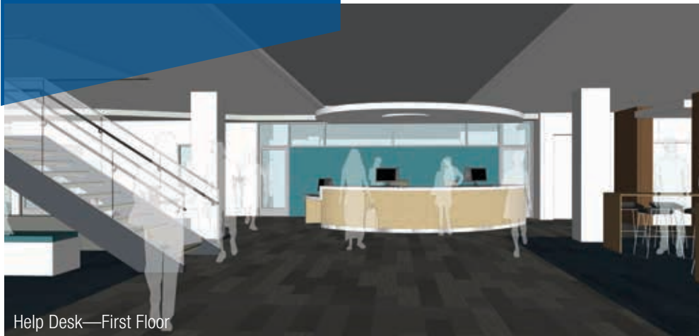
Help Desk—First Floor

Developed by the Indiana University Advanced Visualization Lab, the IQ-Wall uses off-the-shelf hardware and open-source software to provide low-cost, advanced visualization across a thin, energy-efficient flat-screen monitor. These panels can be used to display art, weather reports, and news stories, and may be used separately or combined for a variety of presentations.