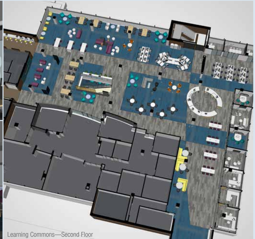
Learning Commons—Second Floor