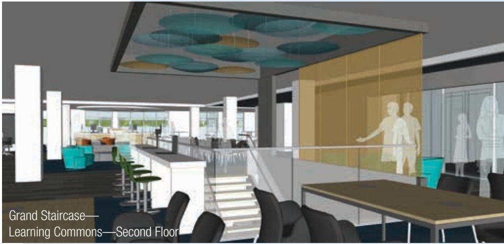
Grand Staircase— Learning Commons—Second Floor